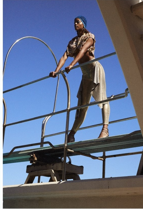
SILVER | GOLD METALLIC BOLERO JACKET RUFF TUNG MESH GOLD HAREM PANTS DIONNE AT ALCHYMIA BLUE | PINK BATHING CAPS CALLY GOLD LACE UP STILETTO HEELS ZOOM GOLD HOOP EARRINGS FOREVER 21