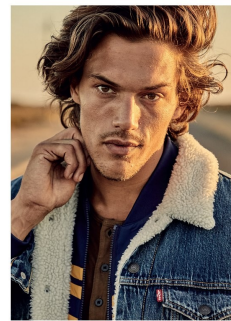
A WEAR SHEARLING A fun or stylish shearling is the new frontier for denim or leather jackets this season, and it's not to the '70s. We've seen anything from heavy T-shirts to a turtleneck, the member now easily comes. Shows in full proof options, and looks great against the light. The appeal to denim's jeans, pants, and even shoes. FROM: TACOS; JACKET BY: HUGO BOSS; WEAR: HUGO BOSS; SHOES: HUGO BOSS