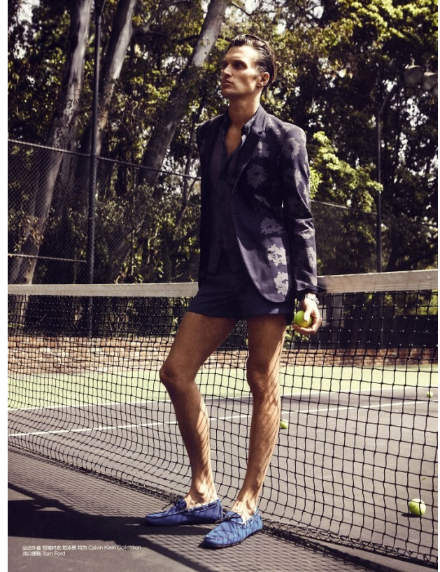
服装师: 陈耀林 化妆师: Calvin Klein (London) 发型师: Tom Ford