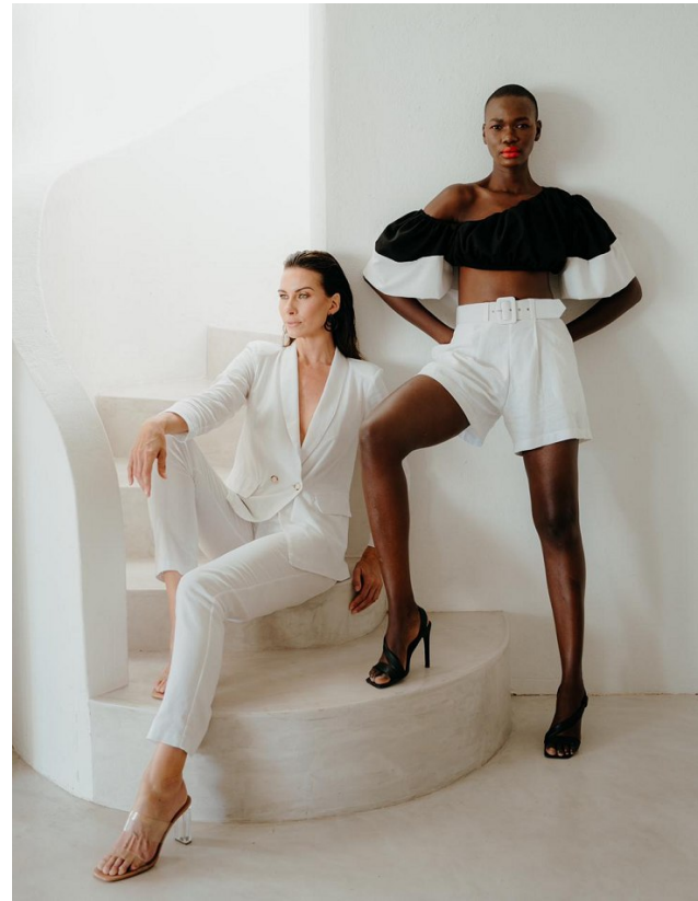
Height: 180cm Bust: 86cm Hair: Dark Brown Eyes: Blue